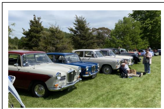
Some of our Club Cars at the Canterbury All British Day

At the beginning of November I organised and ran what would be my final Canterbury All British Day, which as usual started at the VCC grounds at McLeans Island. I'd made the decision that this would be the last one I organised, given that the British and Euro Show was going to be run in Christchurch in March 2026, and would probably continue as an annual event from there onwards, as it has in Auckland, Wellington and Dunedin. This year I set the instructions to finish the runs at the Ohoka Domain, which is where the very first one I organised in 1988 ended. It was a rather bare and uninviting domain in those days, but since then the