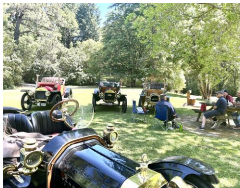
November's Veteran Random Run to Ashley Gorge

During the month we've also been able to get out on each of the two veteran Wolseleys a few times. We've had the 1909 car out on display at the Hororata Highland Games, and the 1912 12/16 has made a couple of coffee runs to Kirwee, and was also taken on this month's veteran Random Run to Ashley Gorge (a