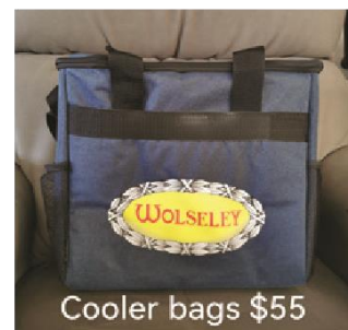
Cooler bags $55