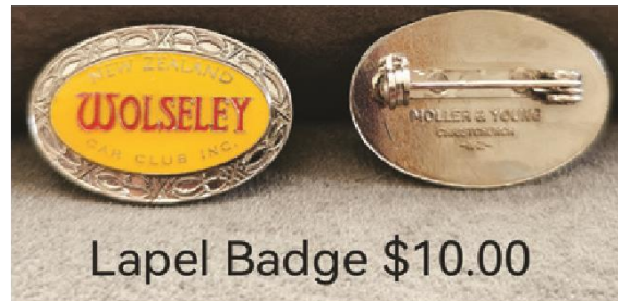
Lapel Badge $10.00