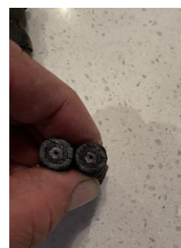
What a 50-year-old clutch hose looks like inside