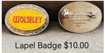
Lapel Badge $10.00