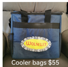
Cooler bags $55