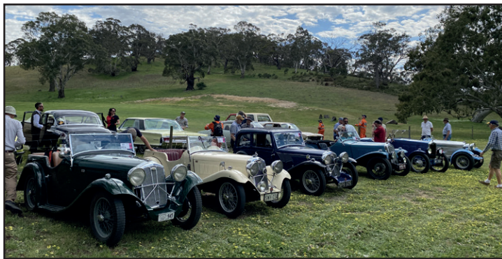
Hornet Special Club display at the finish at Birdwood National Motor Museum