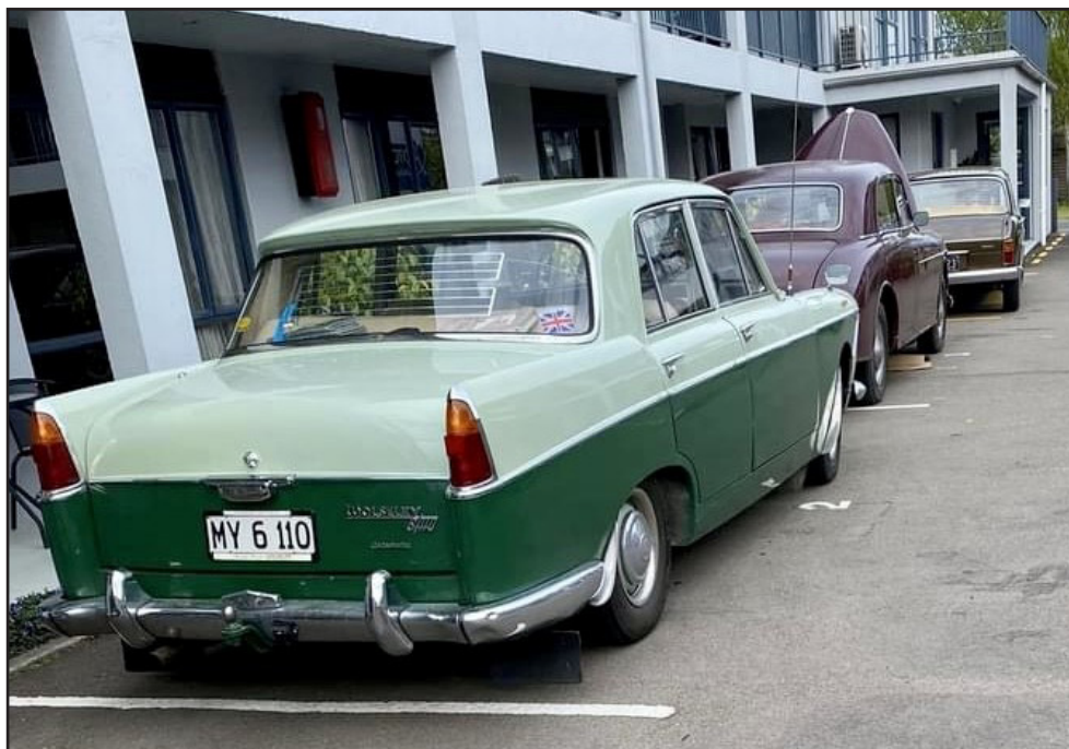
Cars at the the Taupo Motel for the AGM