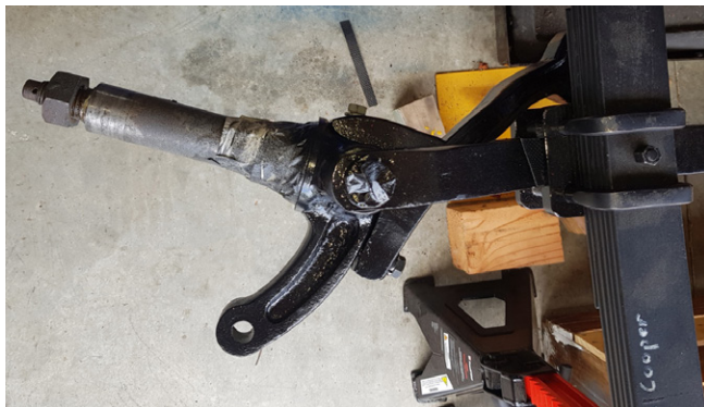
Front axle, new Kingpins and that limited turning circle.

The Gearbox. What was initially there, project wise, was a Wolseley 1911-12 box. Yes, it was a 4 speed 16/20HP box, but shaft over shaft type and vertical in its dimensions. What was there in 1905 was a 4-speed side-by-side shaft, flat dimensions box, with off-set input-output shafts. Thoughts: did I use the current