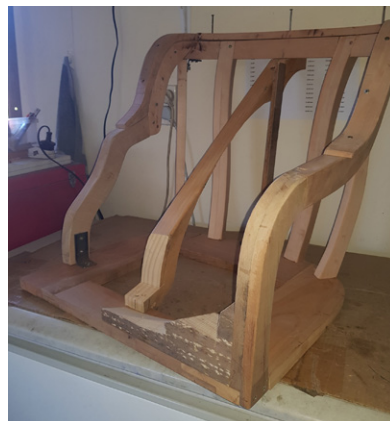
LHS Roi-des-Belge seat frame with internal profile