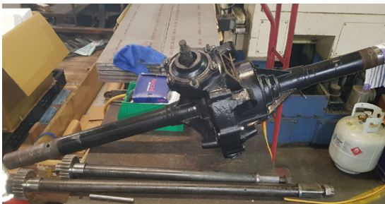
The Diff refurbished awaiting shortening of half shaft lengths

See you again when there is more “progress” to share.