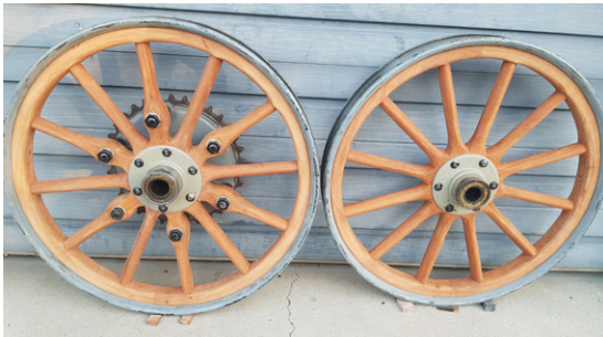
The new Siddeley wooden spoked wheels by Vern Jensen