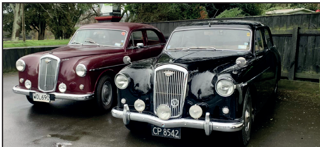
Two 690s in Whanganui