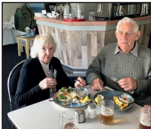
Our tour guides of the Kaitangata Museum