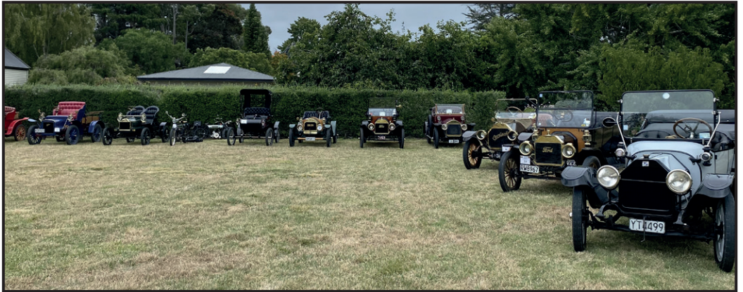
Some of the cars and bikes at the National Veteran Rally