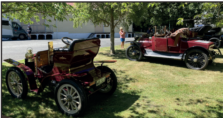
Grandma and the 12/16 have a rest in the shade at Coleridge.