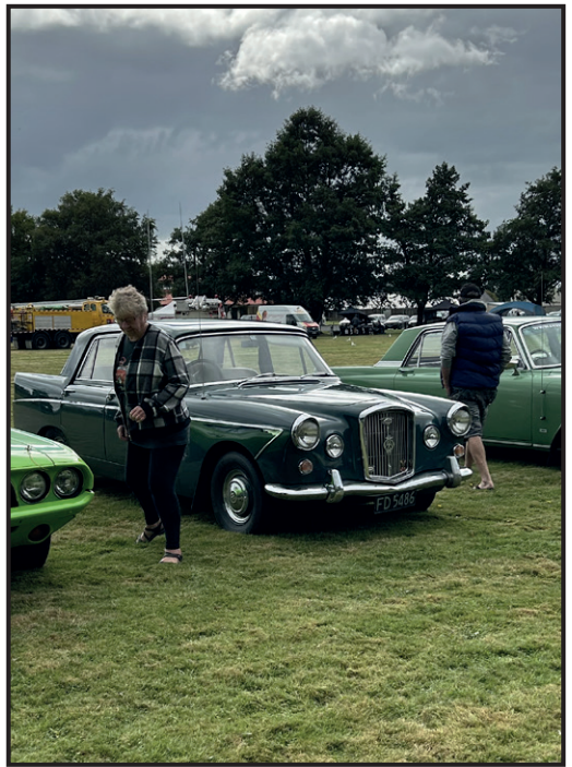
Lawrence Car Club at the Otautau Car Show