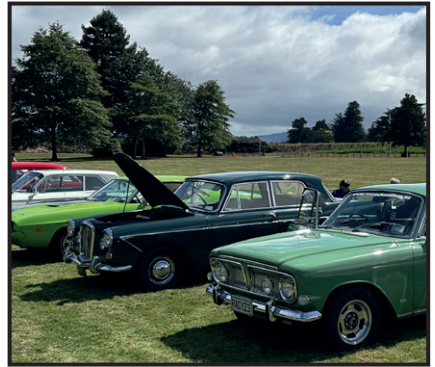
Lawrence Car Club at the Otatau Car Show