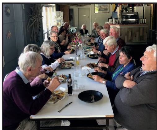
Our lunch at the Pub