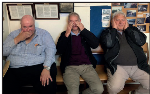
3 Wise men or Speak no evil, See no evil, Hear no evil