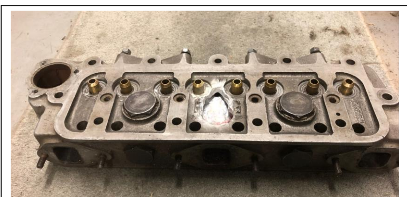
Unsuccessful attempt at repairing the Derrington head. The top section was cut open, but this still didn't allow enough room to gain access the full length of the crack.

Unfortunately there has been no progress on securing a new cylinder head for the 1500