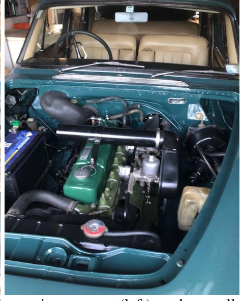
Engine bay being refurbished while the engine was out (left), and now all put back together again, new engine installed.

renewed your membership get it done as October is the last month you will receive the Wolseley Word if you don't. Contact the club representative for your area inside the front page of the Word or if not sure contact National Sec or Myself. Take care on the roads, for us.