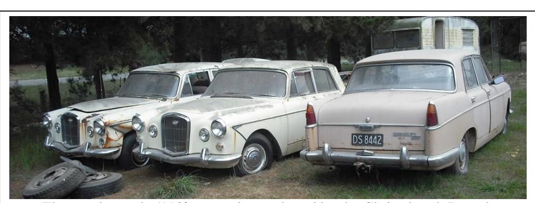
Three rather sad 6/110's recently purchased by the Christchurch Branch