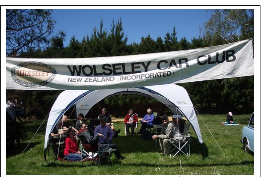
Picnic time at the All British Day, 1<sup>st</sup> November

Sunday at the Swap Meet was very quiet, and our gun sales team cracked into action, this time requesting donations for the left-over stock. At the end of the day there was very little left. The car parts that were left over were donated to the Vintage Car Club spare parts shed, and the few items left over were taken back to Idlewood to be dealt with later. All up nearly $3,000 was raised – a terrific result! Thanks very much all members who donated