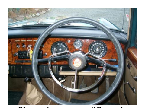
Photo shows one of Roger's steering wheel covers fitted to Gordon Duthie's 6/110.

<u>6/110 for sale – Mk1 manual (3 speed + OD)</u>. Good going order, registered with WoF, some spares included. Contact Russell Poppe on 03-304-7127 or 0274-372-178, or Kevin Poppe on 06-327-7578