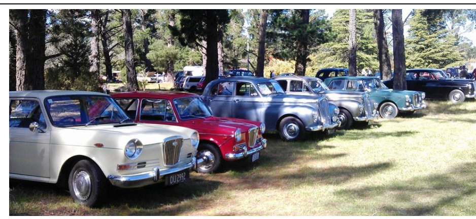
Our display at the VCC Swap Meet

Unfortunately the pickings were pretty slim, but most people found something for the