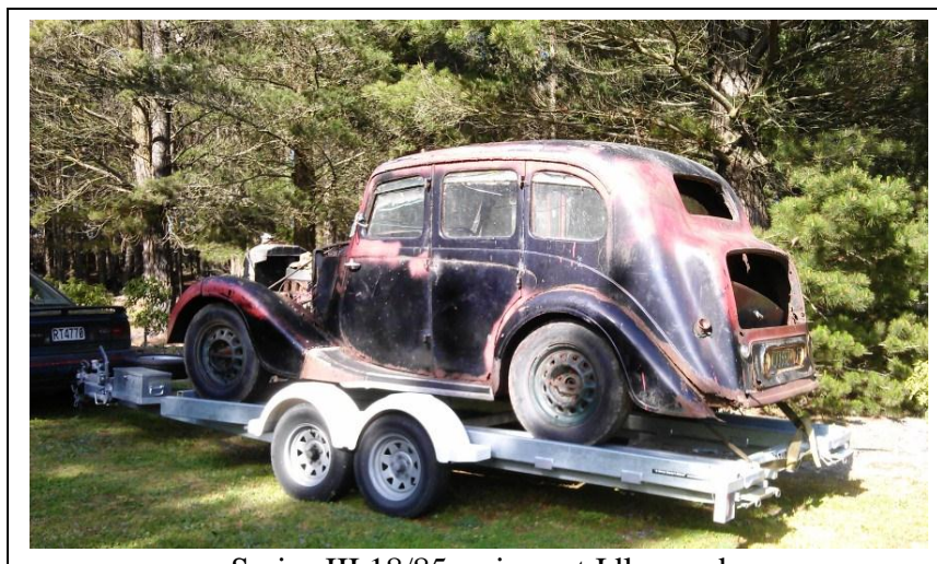
Series III 18/85 arrives at Idlewood

The area around Idlewood was once again hammered by strong winds towards the end of the month, bringing down even more trees, including a few more around the Jowett Club's area. The clean-up will continue.