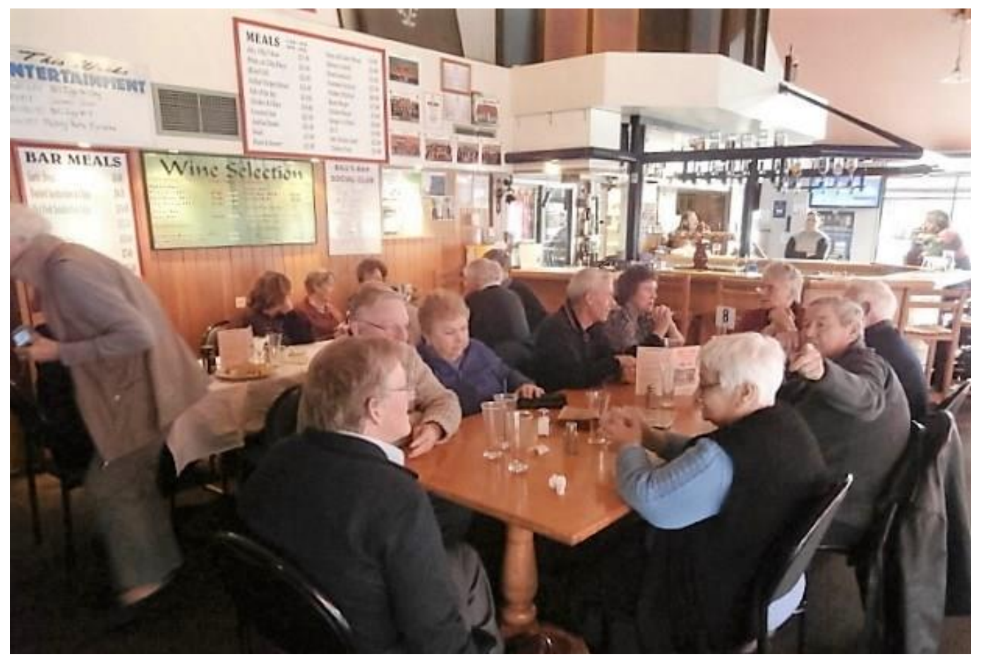
On the Retirees outing – enjoying lunch together