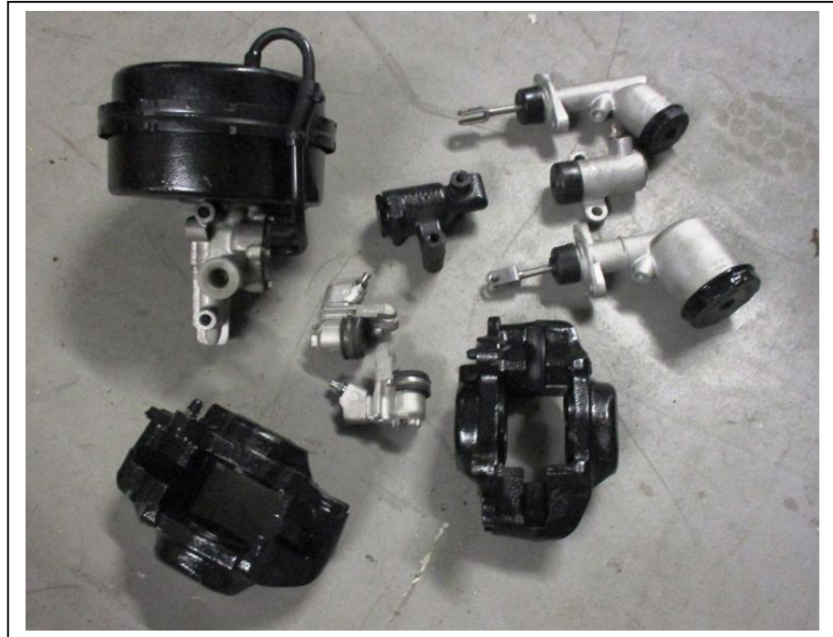
Reconditioned hydraulics for the 18/85 project

town and had them overhauled with stainless sleeves. It wasn't cheap, but at least I know they will be good for a long time to come, and there should be no issues in that department