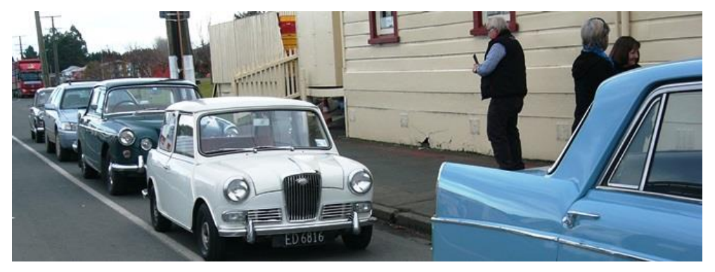
Cars outside the old Mosgiel Railway Station