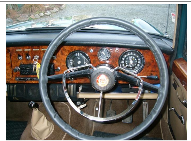
Photo shows one of Roger's steering wheel covers fitted to Gordon Duthie's 6/110.

Quality reproduction hand-made 1940 to 60's style vinyl covers with foam backing for driver comfort, made to measure with a choice of colours. Includes stitching cord, a bodkin and fitting instructions. The diameter of your steering wheel and its rim required. Good value at $63 each. Phone Roger Honey on 06 8684846 or 0274780872. email rohoney@clear.net.nz (Club Member)