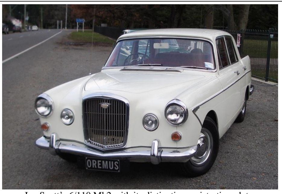
Ian Scott's 6/110 Mk2 with its distinctive registration plate.

there is no real need to do that each time it is taken out! I think Simon could have done with the plate on his car that day!