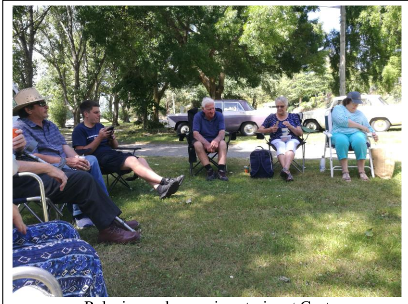
Relaxing and swapping stories at Cust

Our first run for the month happened on 27th January, and was a simple run in the country,