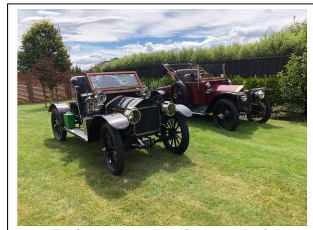
Both veterans out at home recently.

a lack of supply from the tank, which is in the boot of the car. It sits only slightly above the level of the carburettor, and unless that tank is completely full, there isn't enough flow when running on full throttle in top gear, or especially when heading even slightly uphill. I tried to cure this last year by sealing up the tank and fitting a period-style hand pressure pump, and while this certainly did help, it didn't cure it completely, and it was also hard work on a long run. I had decided enough was enough, and I got busy and then fitted an electric fuel pump. I'm afraid the desire for reliability out-stripped the need for