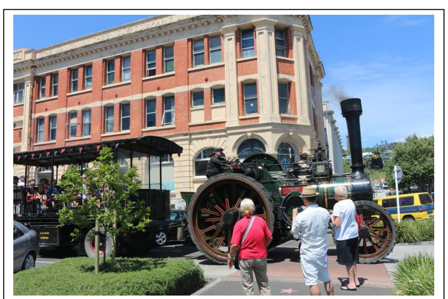
At the VCC Vintage weekend in Whanganui

Last weekend we attended the VCC Vintage Weekend in Whanganui they had a display down the main street with about 200 cars in attendance. Also live Music on two stages.