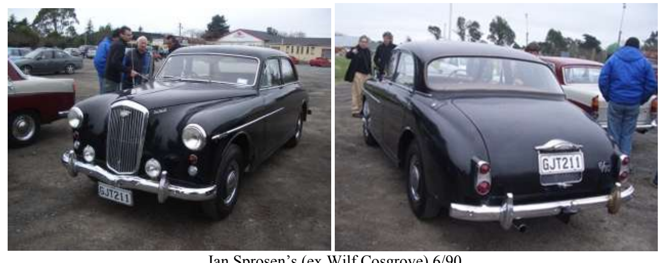
Ian Sprosen's (ex Wilf Cosgrove) 6/90

The past month has been pretty quiet -a spell of wet and cold weather not doing a lot for our collective enthusiasm and outings. The one outing we did have planned (a visit to a stud farm) had to be postponed due to flooding and mud on the property we were to go to. A short run was put together instead, finishing up at Idlewood for afternoon tea in the shed around the patio heater – very social but definitely not the interesting event that would have been our first choice. One good thing about the run was that it bought out three 6/90's – the lovely Series 1 belonging to Anthony Dacre, and two Series 3's belonging to Allan and Betty Francis and to Ian Sprosen. Ian has only just acquired his 6/90 (a longtime favourite model of his), having recently purchased it from another branch member, Wilf Cosgrove. Wilf had spent a lot of time getting this car back on the road, and needed to sell it after recently moving house. It is a very original and honest car – and even though it could do with some cosmetic attention, in some ways it's great to see it in its worn but original state. There are not many around like that anymore, and a less than sympathetic restoration could possibly spoil it.