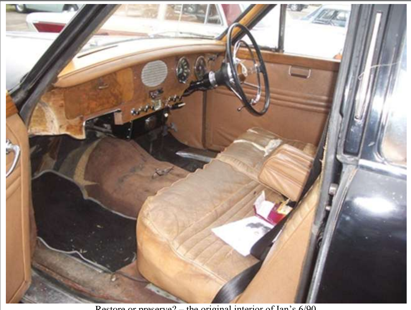
Restore or preserve? - the original interior of Ian's 6/90

Our working bee for August was at Idlewood, and a number of smaller jobs were completed. We now have rain-water storage tanks which collect the water off the main shed roof. These will be used to supply water by the bucket-full for the plants that the team have planted around our allotted area. They were filled rapidly in the rain soon after they were built, so they got off to a good start.