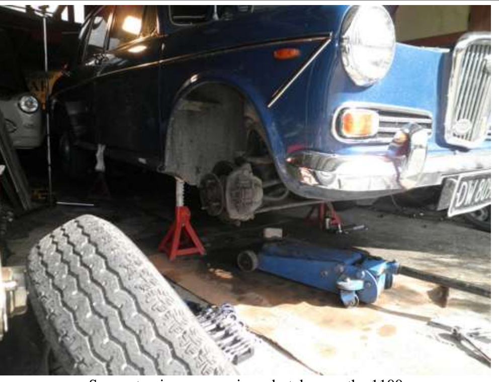
Some steering surgery is undertaken on the 1100

Fortunately we had a really good secondhand one that came off the parts car we bought when we first got the 1100, so the rack itself wouldn't have to be dismantled and re-bushed – just a simple swap-over job would do the trick. This isn't quite that easy on an 1100, as it's necessary to lower the front subframe/engine assembly to be able to get the rack out and in again, but once again the Haynes manual was